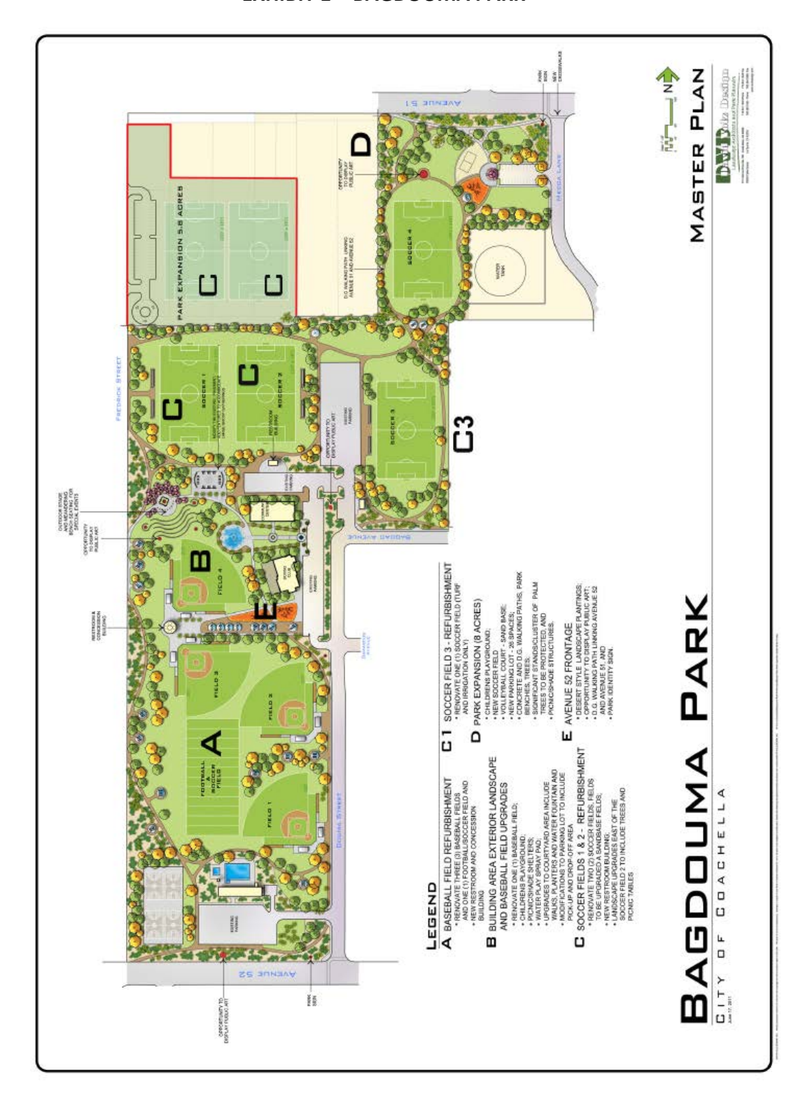
EXHIBIT 1 – BAGDOUMA PARK